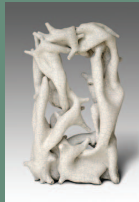
Birds Nest, Kwon, Shin, 2000