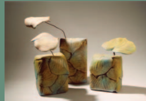
From the Leaves, Hong, Soon Jung, 2006